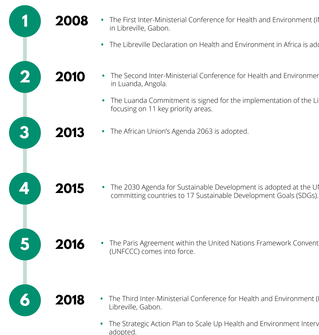
Figure 1. Libreville Declaration within the wider policy landscape: From 2008 to the present day

Since adopting the Libreville Declaration, several agreements and frameworks have added further momentum to these continental efforts and provide further support to the process (Fig. 1). Anchored in the United Nations' Sustainable Development Goals (SDGs), these agreements commit countries to the principle of self-reliance through ownership of local and regional programmes, and to reducing the impacts of climate change. Mitigating the adverse health