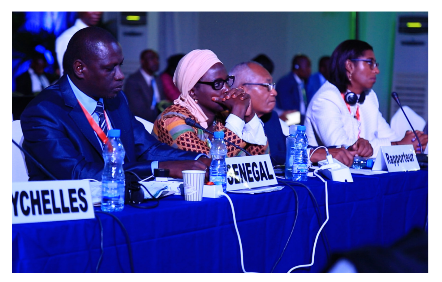
During several plenary sessions, the floor was opened to delegates, ministers and experts from 46 African countries to share their experiences around implementing the Libreville Declaration and ways to accelerate progress in the future.

A number of side events were also hosted throughout the conference to discuss innovative ways to tackle the threat of environmental impacts on human health in Africa