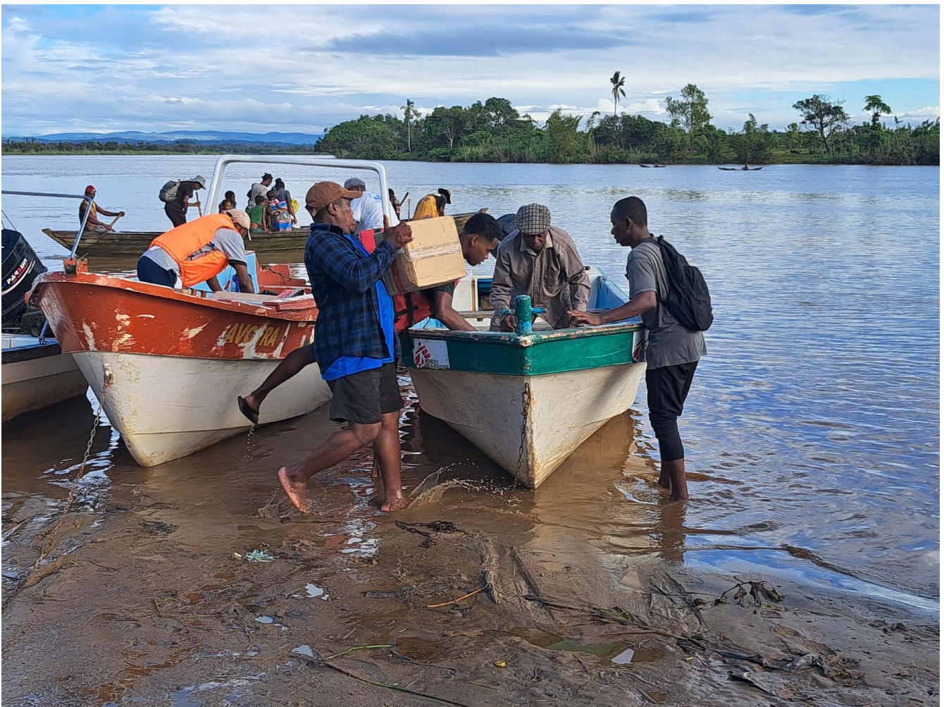
Climate change worsens health problems in Madagascar. An MSF team places in a boat some supplies that have to be transferred to a remote health center in Nosy Varika. Poor infrastructure and heavy rains worsen access to health care for the people in remote communities in Madagascar. MSF teams travel by boat, plane, motorbike or by foot to reach the health centres in remote areas.

systems, and proper assessment of climate and health vulnerabilities are needed to guide targeted adaptation. Environmentally-informed public health surveillance systems and the availability of localised climate data are needed to better understand climate-health relationships and protect the health of populations. Community trust and engagement is needed for successful uptake of adaptation solutions. And crucially, ambitious emissions reductions are needed to ensure adaptation strategies remain effective.