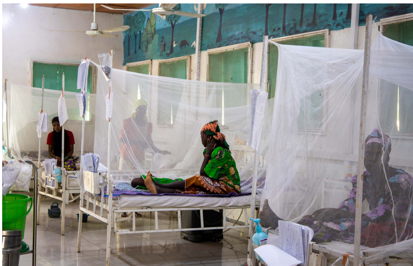
Niger: climate change adds more hardship for the most vulnerable. Every year, when the rainy season and the lean season begin, malaria and malnutrition are on a steep rise, especially among children under five. MSF increases its volume of activities to respond to the growing needs in the paediatric unit at Magaria's hospital, where the organisation has been present since 2005.

However, environment-informed public health surveillance extends beyond integrating climate data into infectious disease monitoring. Environmental contaminants significantly contribute to non-communicable diseases and can affect the transmission of infectious diseases. 16 Few studies investigate the combined role of environmental degradation and climate change on human health. Existing integrated systems primarily monitor air and water quality related to health outcomes, especially communicable diseases. While contaminants from industries like mining, oil extraction, agriculture, battery recycling and others often goes unmonitored. However, given the link between environmental pollution and climate change, adapting health surveillance systems to be not just climate-informed but also environmentally-informed requires the incorporation of contaminant monitoring.