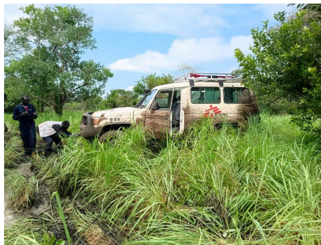
MSF vehicle gets stuck while conducting the first round of a multi-antigen vaccination campaign in South Sudan during the rainy season.

Climate change acts as a threat multiplier, exacerbating existing health issues and inequities. 8 Crises such as extreme weather events can overwhelm healthcare systems, often leading to temporary suspension of non-acute care services. These services are suspended to reinforce acute care for a surge of patients with severe short-term medical needs or due to population access constraints. Yet the fallout from climate shocks is often most keenly felt by patients that rely on long-term services for their survival. Attention is diverted to immediate visible causes of mortality, while the true burden of morbidity and mortality may be less obvious among already vulnerable populations, such as people with