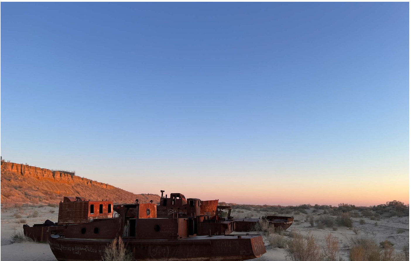
Abandoned fishing ships at the former Aral Sea port of Moynaq, Karakalpakstan. The sea shore is now more than 100 km from this once bustling seaside town.

This ongoing investigation provides the first set of comprehensive, publicly available data from the region in more than 20 years. Findings will inform an intervention that reduces health impacts by targeting exposure reduction in the most vulnerable and susceptible subpopulations.