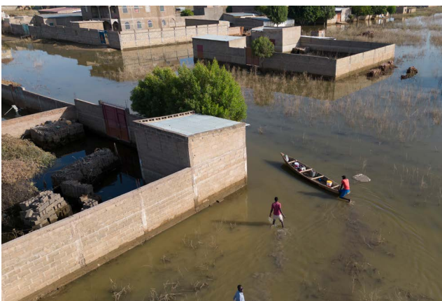
Aerial view of flooding in Didangali district, N'Djamena, Chad. Didangali district is on the southern outskirts of the capital. Three men are using a boat to try to reach their home to retrieve blankets and some utensils. Most of the displaced people were unable to take many things with them. Much of their possessions either washed away in the flood or were abandoned to facilitate evacuation.

The complexity of climate change and environmental degradation, coupled with highly politicised and siloed global response efforts often make it insufficiently clear to health and humanitarian implementing partners that every issue is part of a continuous process, where each component informs the others. In this brief, MSF staff outline six focus areas where teams are engaged in developing environmentally-informed health and humanitarian interventions, emphasising their interdependence, and how failure to act on one issue not only impedes progress on that specific component but also affects the entire sequence of subsequent actions.