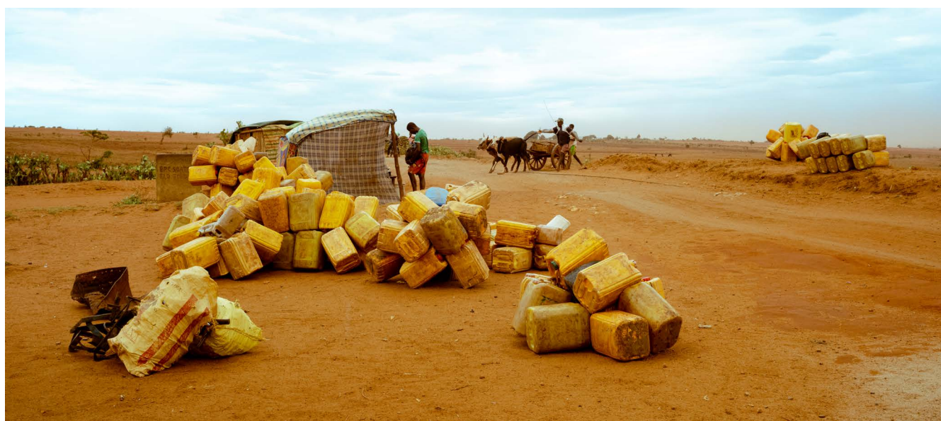
Southern Madagascar. At a crossroads on the national road, empty jerrycans await the arrival of a tanker truck to provide water for the families in the area. Three consecutive years of drought severely affected harvests and access to food. Violent sand winds also covered part of the arable land and food used during the lean season, such as cactus fruit. As a result, the chronic food and nutrition crisis, known on the island as kéré , is hitting the inhabitants even harder.

Greater healthcare resilience is needed to preserve quality and ensure continuity of care, avoiding the consequences of interruptions of non-acute services for those whose lives depend on them. For example, in flood-prone areas, risk mapping can help determine the placement of health facilities to ensure continuity of higher resolutions of care. Emergency response plans should be in place to decentralise certain non-acute care services and include creative referral systems. These plans should be enacted based on established local monitoring and pre-determined thresholds for action.