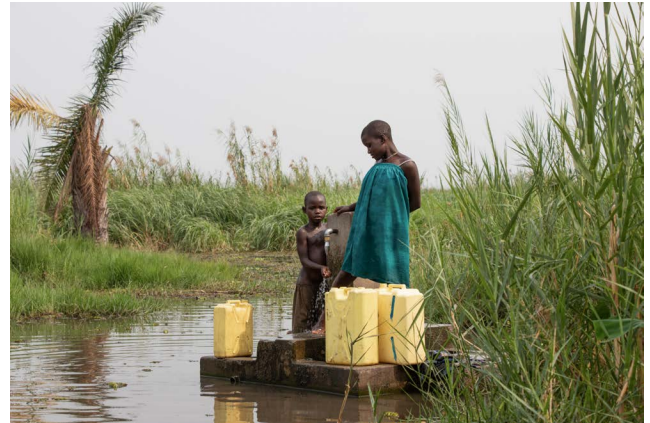
Angumu, Ituri Province, DR Congo. Pamoth is located on the shores of Lake Albert. The camp regularly floods, forcing already displaced people to move again, inland.

Although immediate impacts like injury, displacement, and limited access to healthcare may be similar worldwide, the compounding crises that follow and the capacity to recover from these vary significantly. Individuals in low-resource and humanitarian settings face significant health threats while contributing the least to global emissions. These regions are often vulnerable to climate hazards and possess low adaptive capacity, increasing people's susceptibility to the negative impacts of climate change.