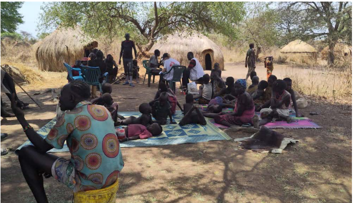
The Health Promotion Manager and Field Coordinator Support assessment team conduct an interview with the Red Chief (Community Leader) and community representatives to better understand humanitarian needs in Labarab Payam, South Sudan.

Environmental changes are altering the fabric of people’s lives and by extension health and humanitarian operations. When an MSF team in South Sudan travelled to Labarab Payam in 2024 to conduct a multi-antigen vaccination campaign, environmental changes had forced the population to switch their sedentary lifestyle for seasonal movement, resembling semi-nomadism. The vaccination team planned three rounds of inoculation but faced continued changes in location and timing of their target population, as population movements were influenced by unpredictable seasonal patterns and unfamiliar patterns of rain that affected the