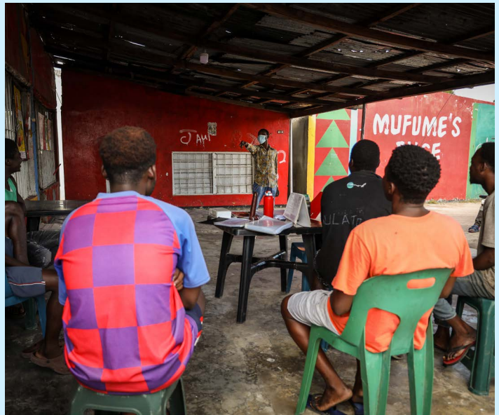
In an MSF community clinic in Beira, a local theatre group performs a short play about the risks of not seeking HIV treatment and the stigma associated with men seeking medical care. By shifting focus from central facilities to community-based healthcare hubs, MSF has brought services closer to affected populations, helping to prevent interruptions in essential care following climate-related events, such as Cyclone Idai

MSF was able to adapt service delivery by mapping additional health centres and employing microplanning strategies, including a method involving peer educators for community outreach. By shifting the focus from central facilities to community-based healthcare hubs, MSF brought services closer to the affected populations. This approach not only addressed the challenges posed by the closure of facilities but also provided a framework for continuous care in the face of future disruptions.