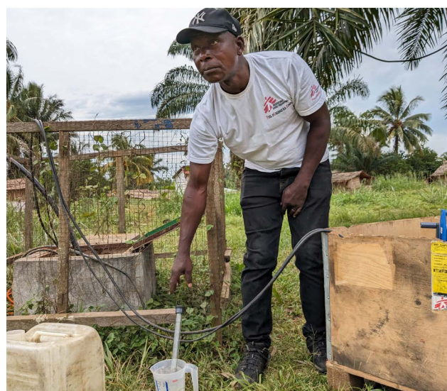
Measles epidemic in Ingende, DR Congo. During MSF's emergency response to measles in Ingende, Equateur province, MSF also rehabilitated the borehole at Ingende's General Reference Hospital (HGR), which had not been operational for more than 6 months.

Key initiatives in climate and health multilateral spaces will dictate which research questions are prioritised and what evidence is utilised. Many evidence gaps fall over humanitarian settings, therefore additional emphasis on these contexts is needed in the next year towards 1) the IPCC, which has begun its 7th assessment cycle, with Working Group and Synthesis Reports due in 2029; 2) research financing institutions, which at COP28 in 2023, established Guiding Principles for Financing Climate and Health Solutions, which included commitments to close evidence gaps through research and accelerate the deployment of effective, locally adapted practices; 3) WHO, which, following the Climate and Health Resolution adopted at the 77th World Health Assembly, are again seeking to develop a global agenda for research for Action on Climate Change and Health to facilitate actionable research, translate evidence into policy, boost funding, and promote inclusive research. 19 This is the moment for evidence gaps, such as those highlighted by MSF, to be placed front and centre as urgent research priorities that focus on achieving equitable outcomes.